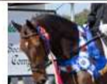
SOUTH July 19-21