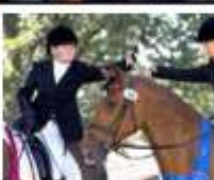
NORTH August 23-25