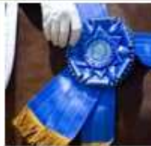
CENTRAL August 17-18