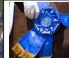
CENTRAL August 17-18