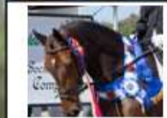
SOUTH July 19-21