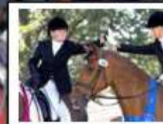
NORTH August 23-25